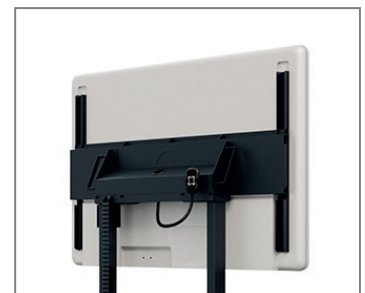
Hole pattern display-specific optimised